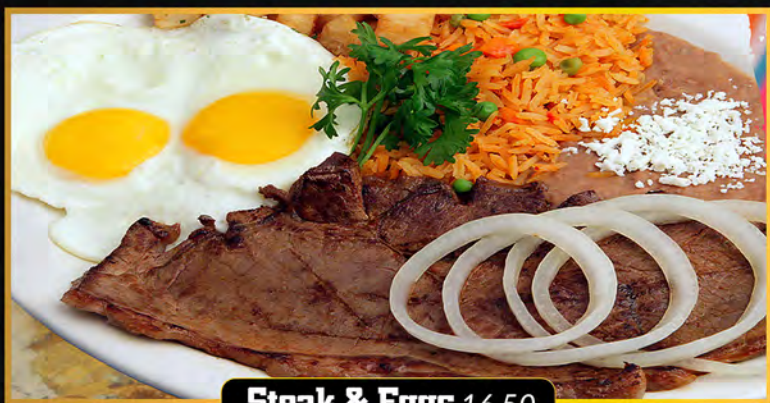
Steak & Eggs 16.50