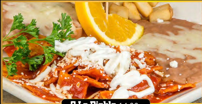
A La Diablo 14.99