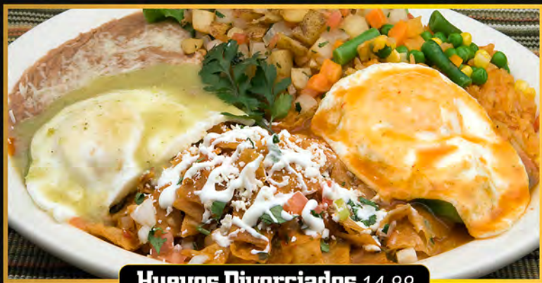
Huevos Divorciados 14.99

Two eggs over medium topped with a delicious home style sauce mixed with cactus