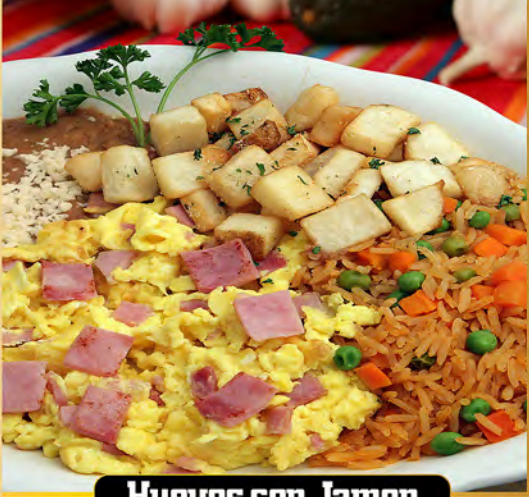
Huevos con Jamon

————— $14.99 ————— Two eggs scrambled with ham