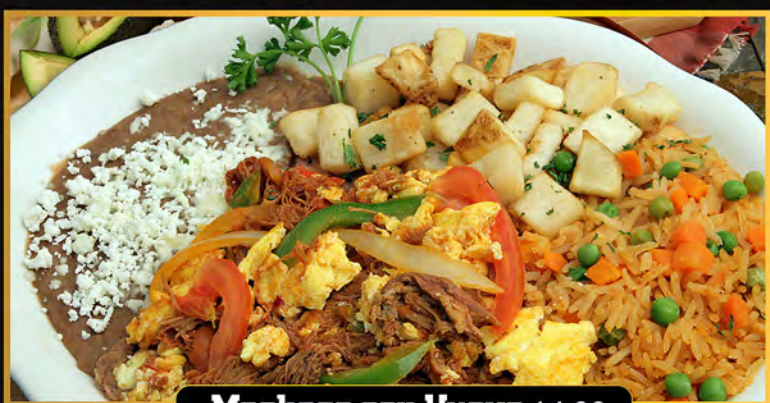
Machaca con Huevo 14.99

Served with beans, rice, homemade potatoes and warm tortillas