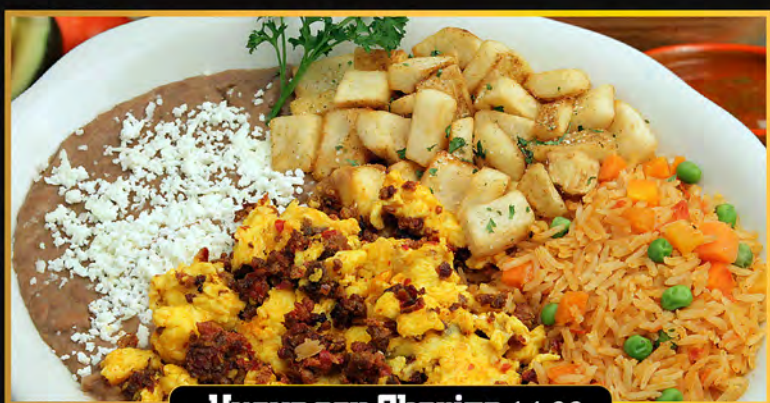
Huevo con Chorizo 14.99

Two eggs scrambled with Mexican style sausage