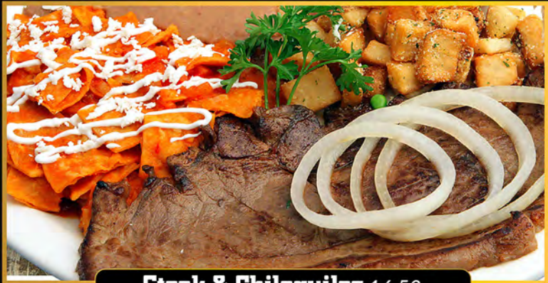
Steak & Chilaquiles 16.50

Rojos • Verdes • Mole • Michoacanos • Quemados • Habanero • A la diablo • Chipotle