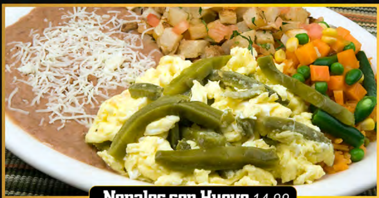
Nopales con Huevo 14.99

Two eggs any style topped with 2 different salsas, divided by a delicious portion of chilaquiles