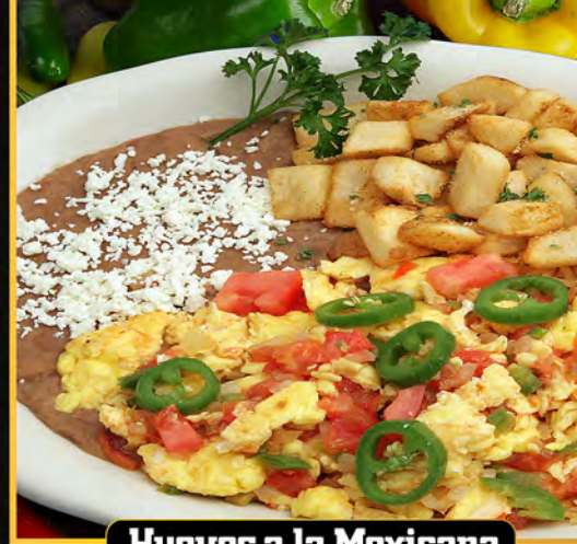
Huevos a la Mexicana

————— $14.99 ————— Two eggs over medium topped with ranchero green sauce