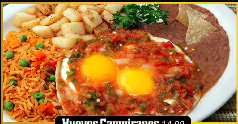
Huevos Campiranos 14.99

Two eggs scrambled with Mexican style sausage