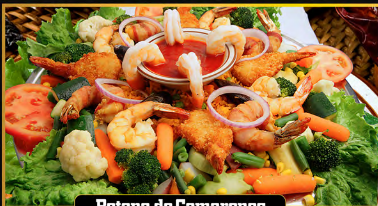
Botana de Camarones