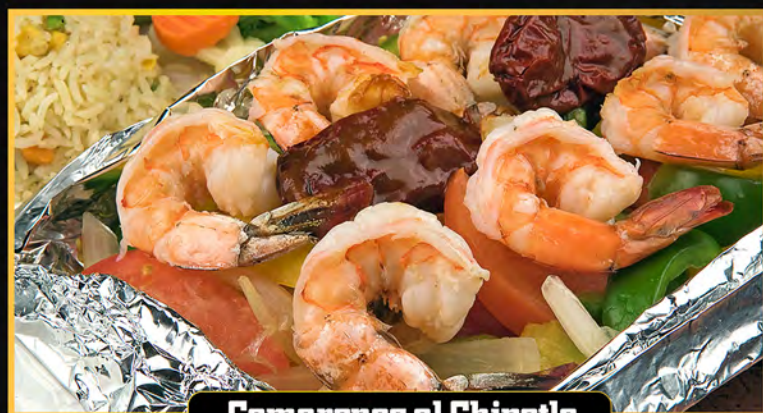
Camarones al Chipotle

Served with steamed vegetables, white rice & seasoned potatoes $24.99