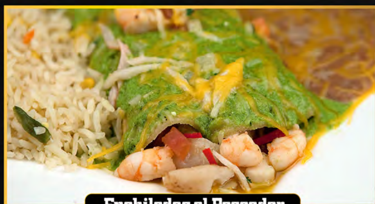
Enchiladas al Pescador

Two wrapped in bacon, two breaded & two in garlic butter $23.99