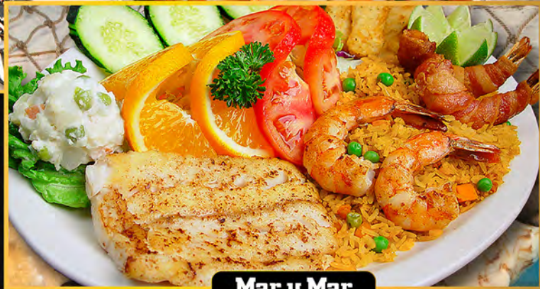
Mar y Mar