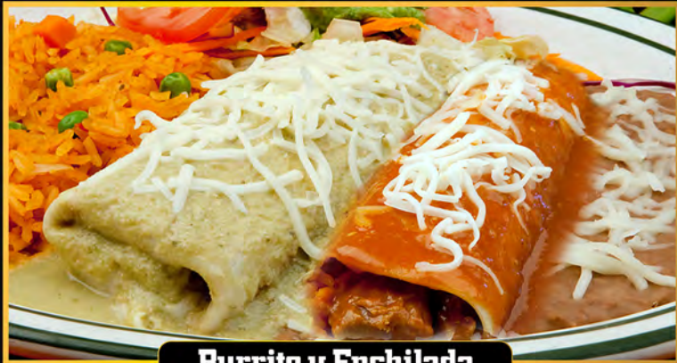
Burrito y Enchilada

ASADA TACO ASADA TACO A LA DIABLA BURRITO ROJO (Beef) BURRITO VERDE (Pork) CHILE RELLENO