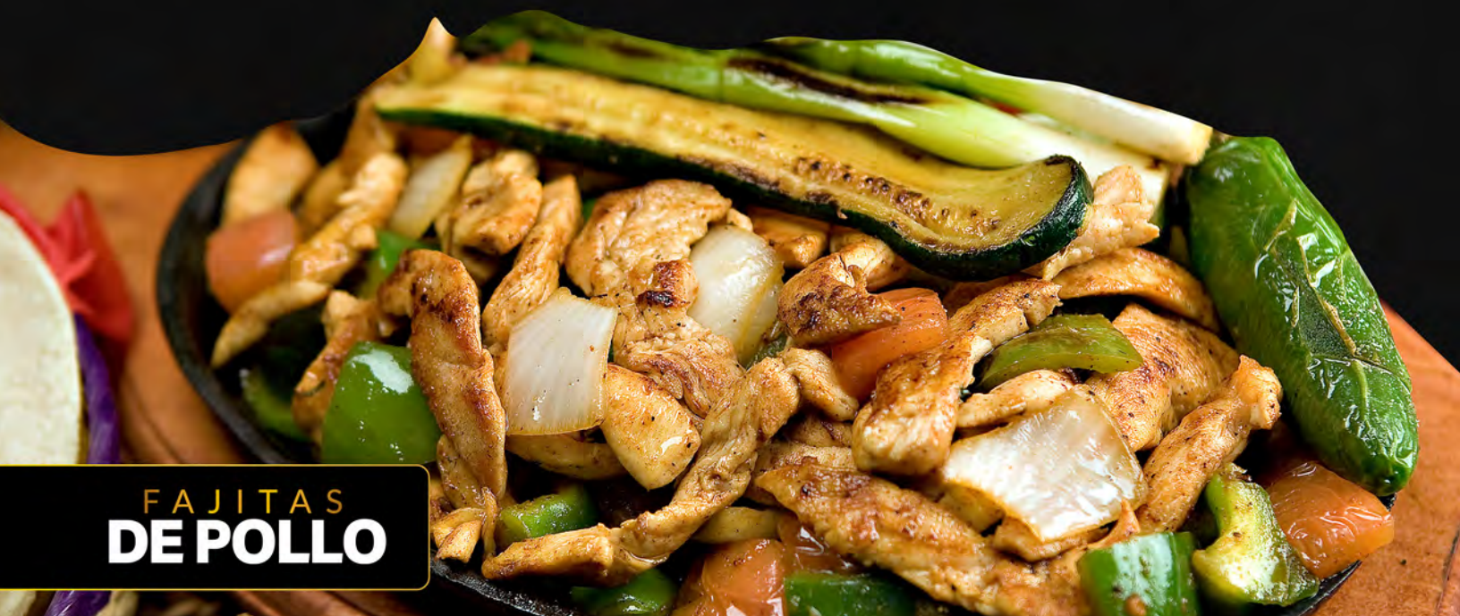
FAJITAS DE POLLO