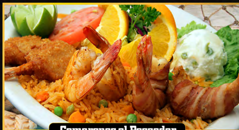
Camarones al Pescador

Steamed shrimp cooked with chipotle cream & vegetables. Served with white rice & steamed vegetables $24.99