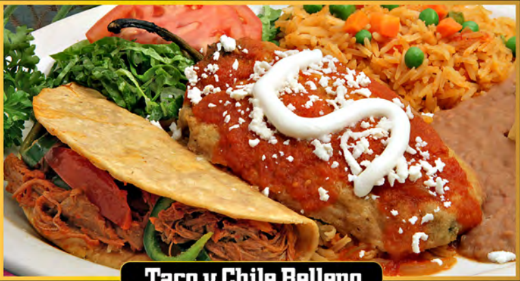
Taco y Chile Relleno