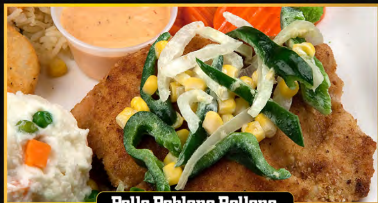
Pollo Poblano Relleno

Breaded thin sliced chicken breast $20.99